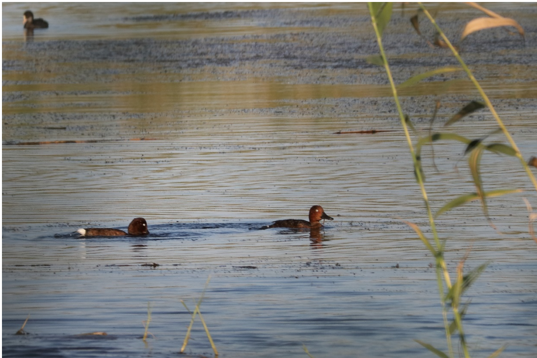
Figure 3: Ferruginous Duck in the basins of the Regional Natural Park "Litorale di Ugento" - 2019 monitoring campaign