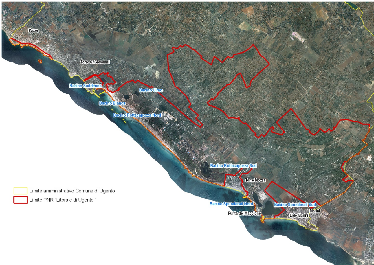
Figure 1: The 7 basins of the Regional Natural Park "Litorale di Ugento"

The halophilic vegetation that develops along the edge of the basins is characterized by formations of Spartina juncea and Juncus maritimus that form part of the Juncetalia maritimi-Spartinetum juncea Biondi 1992 of the class Juncetalia maritimi Br.-Bl. 1952.