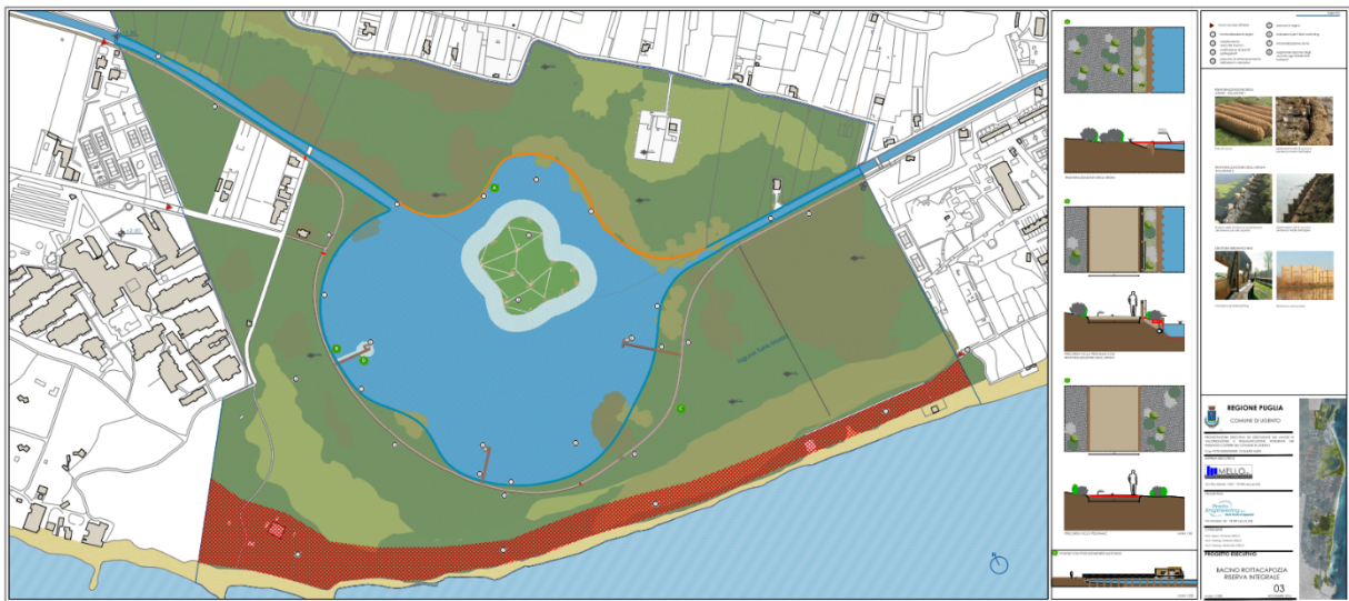
Figure 4: Table of the project called "EXECUTIVE DESIGN AND PERFORMANCE OF THE VALORISATION AND REQUALIFICATION OF INTEGRATED LANDSCAPES OF THE COASTAL LANDSCAPES OF UGENTO"

The second project is called "Conservation and protection of wetlands and dunes in P.N.R. Coast of Ugento and R.N.R.O. Eastern Tarantino Coast of Manduria ". The project plans to re-naturalize the cemented banks of the Ulmo basin and the two channels connected to it, using naturalistic engineering techniques. In particular, the remodeling of the banks of the Ulmo Basin will have the task of: