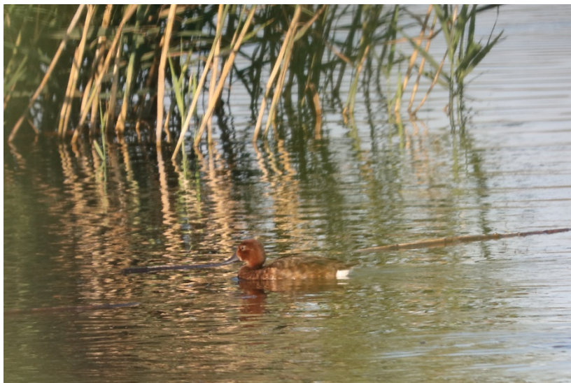
Figure 2: Ferruginous Duck in the basins of the Regional Natural Park "Litorale di Ugento" - 2019 monitoring campaign

The LASPEH project included among its concrete actions for the protection of the Moretta also the realization of a monitoring in order to provide useful and updated data on the presence of the species of interest. The activities carried out starting from July 2019 confirmed the presence of the duck with at least 6 potentially nesting pairs present in the Rottacapoza Nord and Rottacapoza Sud basins. These basins are characterized by less salt water and by a suitable vegetation for the Ferruginous duck.